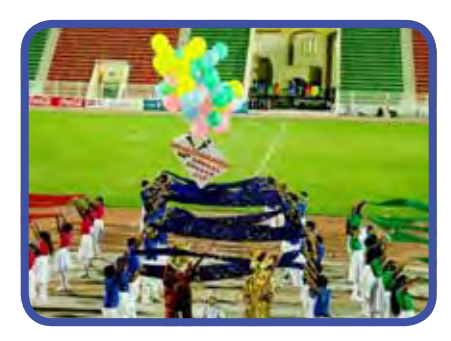
Annual Sports Day