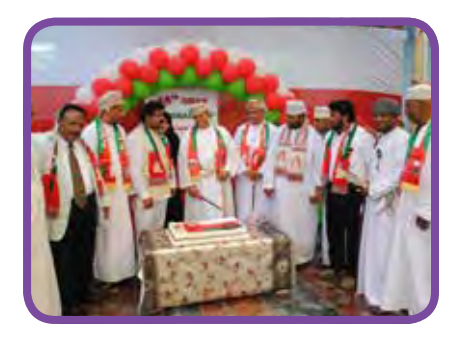
National Day Celebration