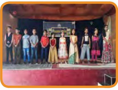
Children's Day Celebration