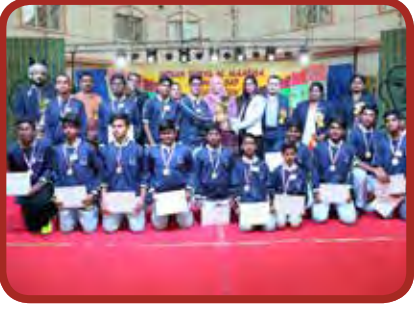
Annual Sports Champions