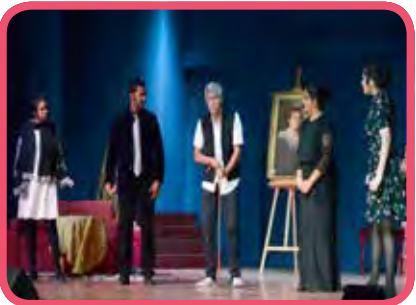
Interhouse One Act Play Competition